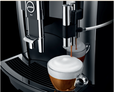
Cappuccino at the push of a button