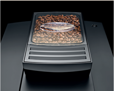
Sealed Bean Container 500g