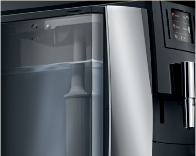
Intelligent Fresh Water System with RFT